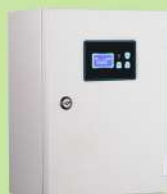
Control Pannel 400 x 300 x 200 MM