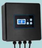
Control Pannel 215 x 215 x 90 MM